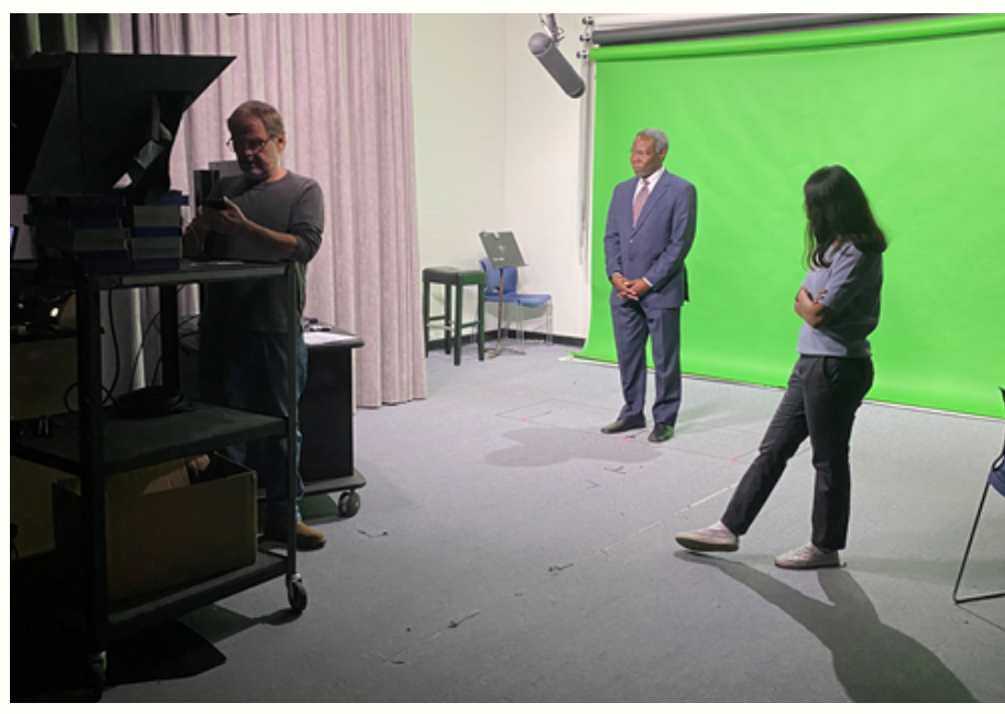
(Recording a video at One Button Studio at U of S)

CFBSJS hired a few marketing assistants to work on increasing impact for the Centre. With the help of the students hired as the marketing assistants, the Centre is working on revamping the website. The main focus of the revamping work is to reorganize the CFBSJS website to highlight the key research and findings of the Centre in order to attract more visitors to the website. Our hope is that this will result in more public education and awareness on the evaluative and research-based contributions of CFBSJS. In particular, we aim to highlight research that directly benefit the programs and services of policing, corrections, justice, and non-governmental criminal justice agencies to better enhance their ability to reduce victimization by addressing the health and wellbeing of justice-involved persons.