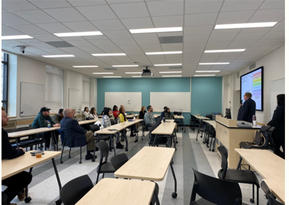
Members of RIB and CFBSJS, USask students)

CFBSJS hosted a Student Networking Event in partnership with the Research and Implementation Branch (RIB) of the Ministry of Corrections, Policing and Public Safety on Tuesday Oct 24, 2023 from 2-4 pm at the University (ARTS 102). This Networking event was planned to provide an opportunity for the students involved with Center to connect with RIB and learn more about their work.